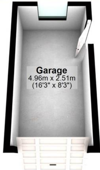
Garage Approx. 12.5 sq. metres (134.2 sq. feet)