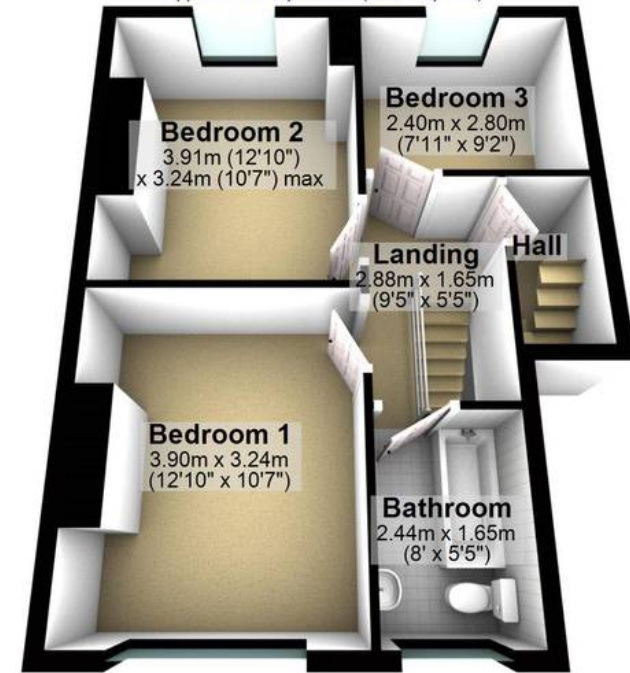
Approx. 44.9 sq. metres (483.4 sq. feet)