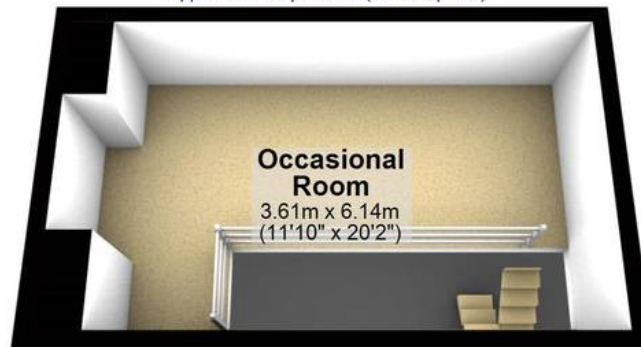
Approx. 22.1 sq. metres (238.3 sq. feet)

Total area: approx. 116.5 sq. metres (1253.9 sq. feet)