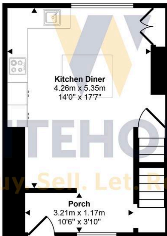
Ground Floor Approx 31 sq m / 335 sq ft