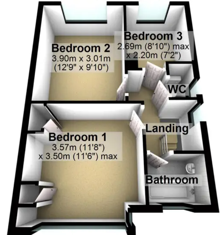
Bedroom 2 3.90m x 3.01m (12'9" x 9'10")