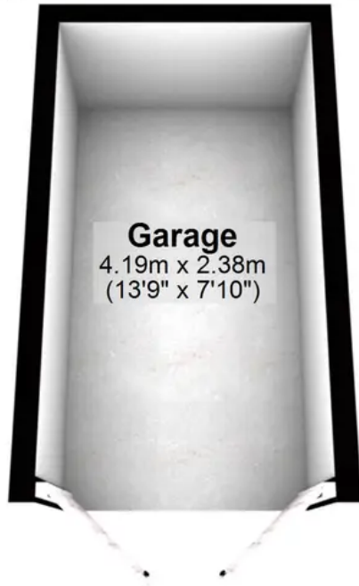
Garage 4.19m x 2.38m (13'9" x 7'10")